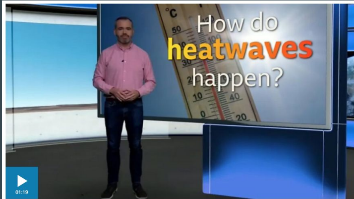
Summer weather: will there be a heatwave?

From coffee to codfish: The foods that will get more expensive with climate change